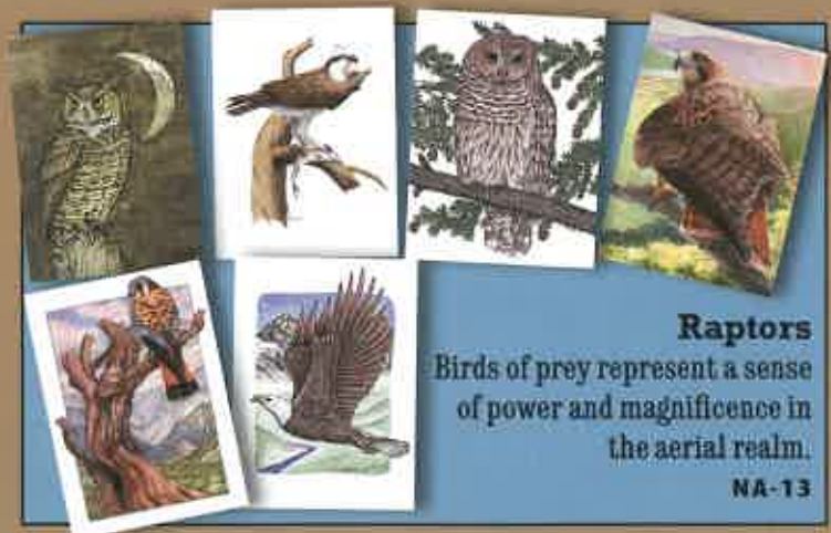
Raptors Birds of prey represent a sense of power and magnificence in the aerial realm. NA-13