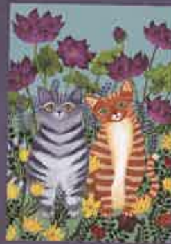
J-297 Two Cats