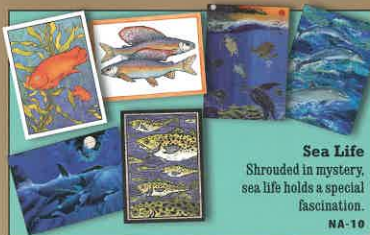
Sea Life Shrouded in mystery, sea life holds a special fascination. NA-10