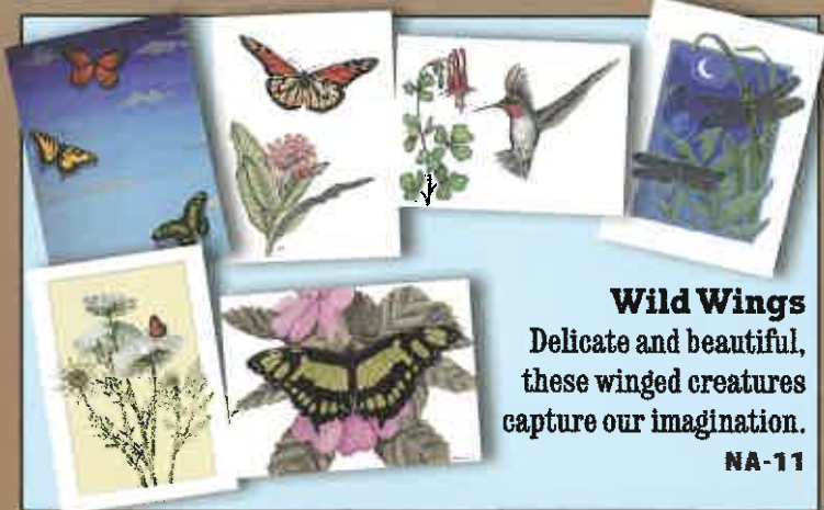
Wild Wings Delicate and beautiful, these winged creatures capture our imagination. NA-11