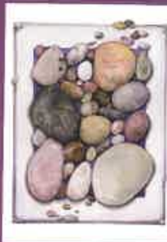
J-289 Tumbled Stones