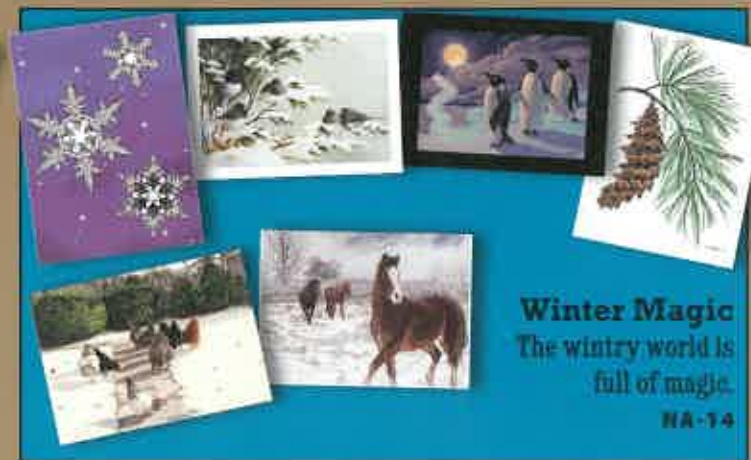
Winter Magic The wintry world is full of magic. NA-14