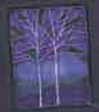
PJ-100 Blue Dusk