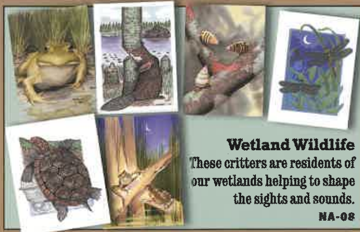
Wetland Wildlife These critters are residents of our wetlands helping to shape the sights and sounds. NA-08