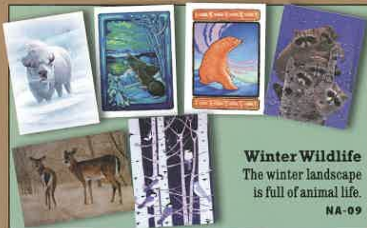
Winter Wildlife The winter landscape is full of animal life. NA-09