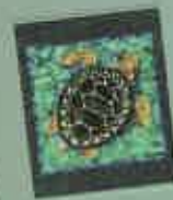
PJ-93 Sea Turtle