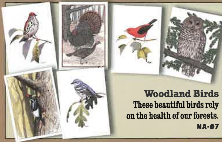
Woodland Birds These beautiful birds rely on the health of our forests. NA-07