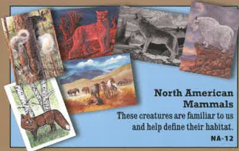
North American Mammals These creatures are familiar to us and help define their habitat. NA-12